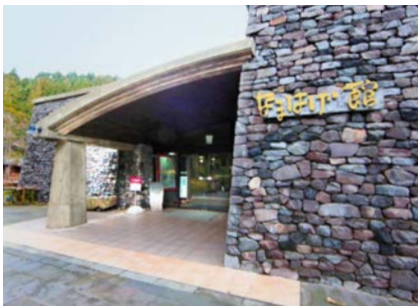
The Namahage Museum, Oga

Exploring the folklore and yokai of rural Japan