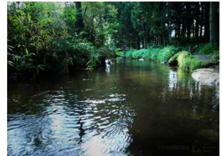
Kappa buchi is only a short walk from Denshoen Park