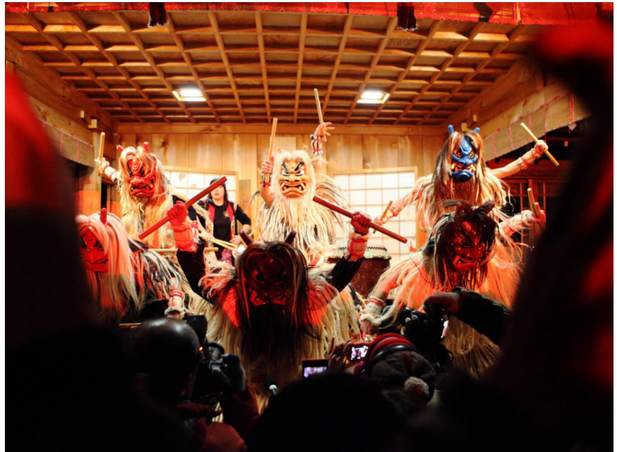
Taiko drumming performance at Namahage Sedo Festival, Oga