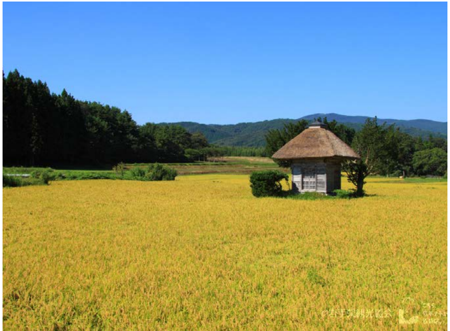
Tono is a rural community where folklore remains important in contemporary life and is a major attraction of tourism