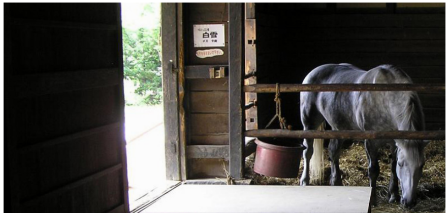
A stable at Tono Furusato Village

Exploring the folklore and yokai of rural Japan