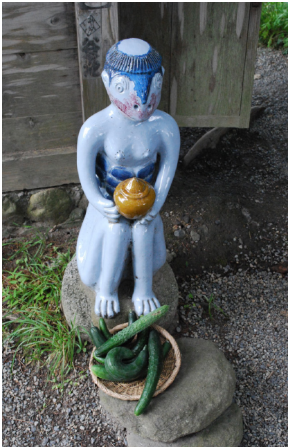
Visitors can offer the kappa its favorite food, cucumbers

Exploring the folklore and yokai of rural Japan