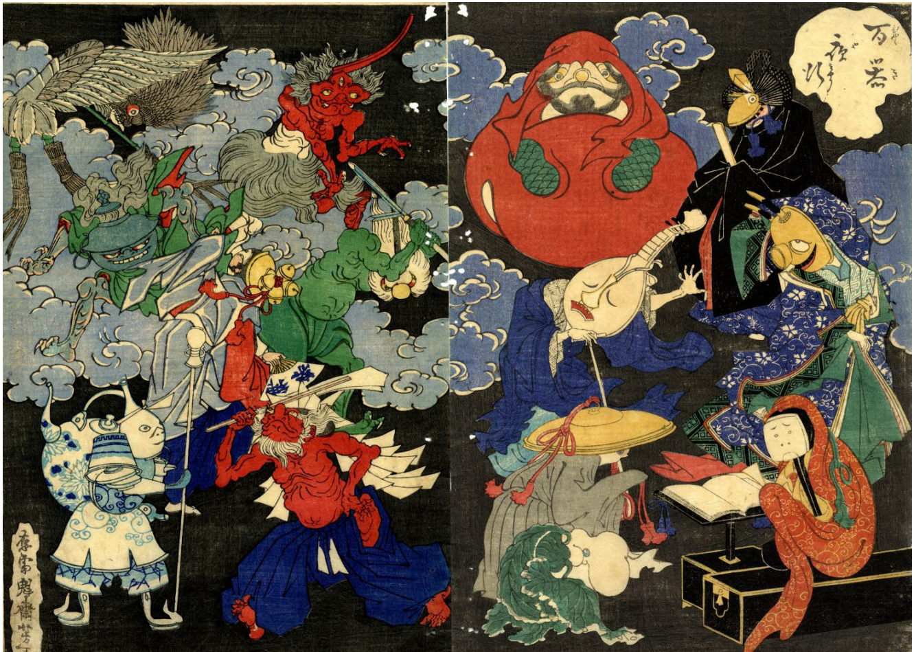
Hyakki yagyo, 1865, Tsukioka Yoshitoshi (1839-1892)