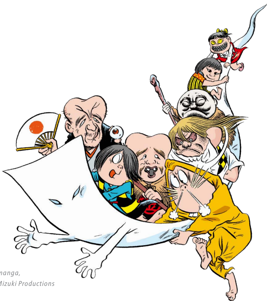
Japan's iconic yokai manga, GeGeGe no Kitaro ©Mizuki Productions