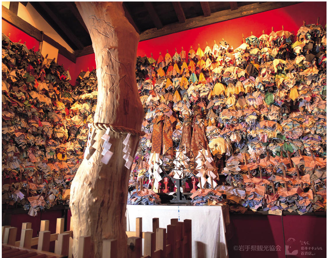
Oshirasama is a local belief system associated with silk production

Exploring the folklore and yokai of rural Japan