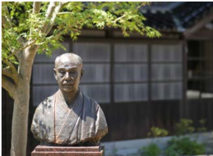
The bust of Yanagita Kunio (1875-1962) at the former Takazen Ryokan, Tono Monogatari no Yakata

Exploring the folklore and yokai of rural Japan