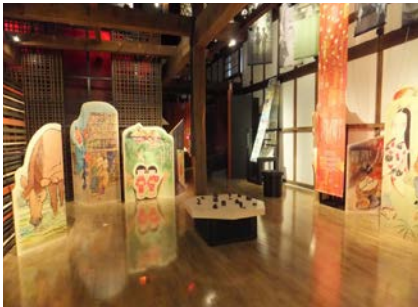
Visitors can delve into the world of local folklore at Tono Monogatari no Yakata

Exploring the folklore and yokai of rural Japan