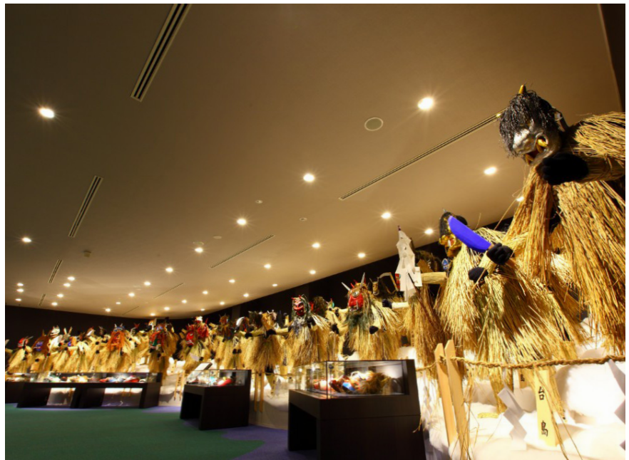
Masks and costumes of Namahage vary throughout Oga. Many of them are exhibited on life-size figures at the Namahage Museum

Even if you cannot make the visit to Oga in the snowy depths of mid-winter, however, you can still experience Namahage. Near the Shinzan Shrine, the Namahage Museum (Namahage-kan) features historical information about Namahage, as well as information about people who have researched it (including Yanagita Kunio). There are dozens of masks and costumes on display, and a film featuring scenes of the New Year's Eve ritual. You might also have a chance to see a mask maker at work. Next to the museum is a small magari-ya farmhouse; this is the Oga Shinzan Folklore Museum (Oga Shinzan Densho-kan), where visitors can experience a reenactment of the New Year's Eve ritual with live Namahage performers.