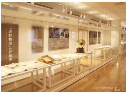
The Tono Municipal Museum explores regional history through exhibits associated with The Legends of Tono