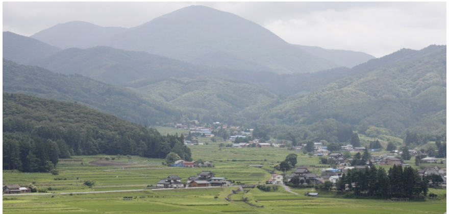
Many tales in The Legends of Tono come from the Tsuchibuchi community in Tono, birthplace of Sasaki Kizen

Tono is situated in what the Japanese refer to as a bonchi , a flat fertile valley surrounded by mountains. It is a small, unpretentious city that has worked hard to develop its connections with folklore, with Yanagita Kunio, with Sasaki Kizen, and with the tales collected in The Legends of Tono . A short walk from the small train station is a museum complex called The Tono Folktale Museum – Tono monogatari no yakata – which features information about Yanagita and Sasaki, and some of the legends in the collection. The complex incorporates the ryokan (Japanese style inn) in which Yanagita stayed on the occasions he came to visit Tono; it also includes Yanagita's retirement home, which was moved to Tono from its original location in Tokyo.