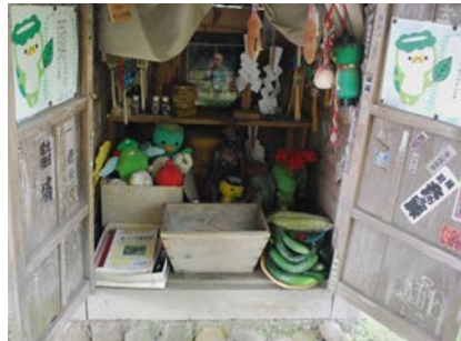
A small shrine at Kappa buchi, dedicated to worshipping kappa