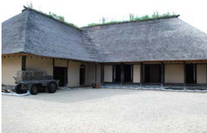
L-shaped farmhouse at Denshoen Park